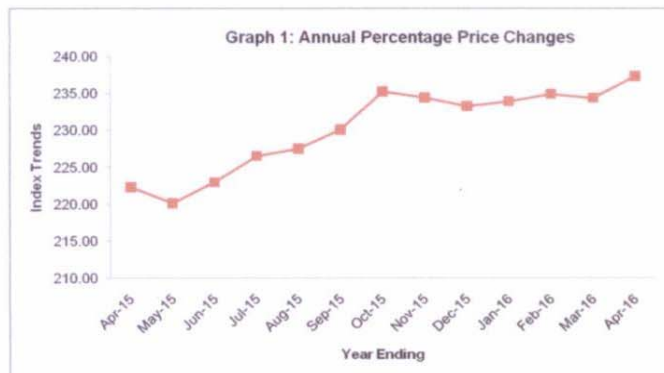
Fig 1: Trends of the Whole Construction Sector Index, April 2015 to April 2016

Monthly Changes showed that in April 2016, there was an increase of 1.3% in the average prices of inputs for the Whole Construction Sector compared to a 0.2% decrease in March 2016. This increase was due to increases in Cement (2.7%), PVC pipes (1.0%), Burnt clay bricks and Tiles (2.4%), Steel bars (5.4%), and Wage rates (5.5%). Fig.2 below shows the trend of the monthly percentage changes of input prices.