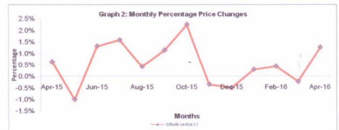
Fig 2: Monthly Price Changes of the Whole Construction Sector Index, March 2015 to March 2016

The overall annual rise in input prices of 6.7% at Whole Sector level for the year ending April 2016 was due to: