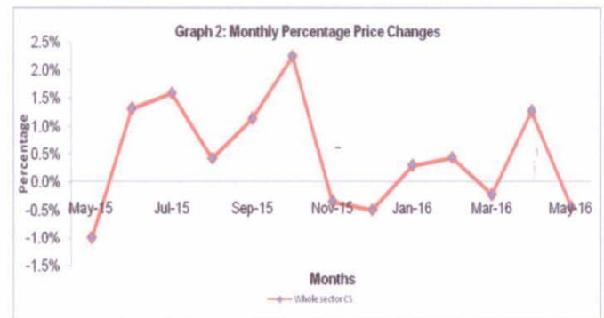
Fig 2: Monthly Price Changes of the Whole Construction Sector Index May 2015 to May 2016

The overall annual rise in input prices of 7.3% at Whole Sector level for the year ending May 2016 was due to: