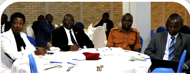
Some of the UBOS Members of Top Management attending the Media Breakfast at Hotel Africana.