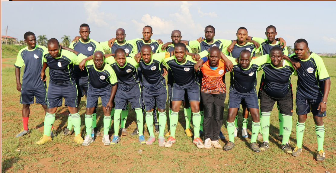
UBOS staff Football team at the ASW 2018 Sports Gala held at Kyambogo University.