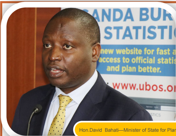
Hon. David Bahati—Minister of State for Planning attending to the Media after the Launch of the Time to Cross and Traders Perception Survey 2017