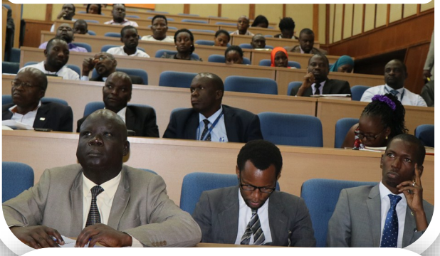
Some of the UBOS staff attending the Review Workshop for the National Statistical System in the Conference Hall.