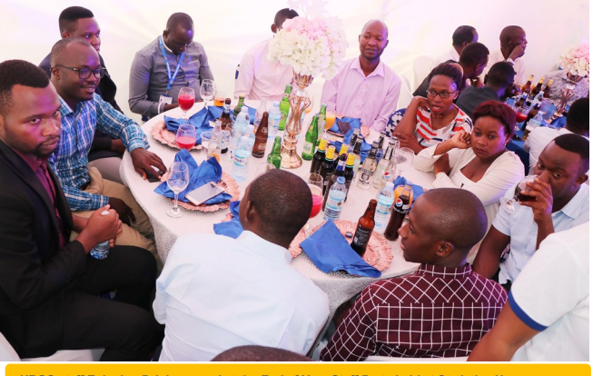
UBOS staff Enjoying Drinks served at the End of Year Staff Party held at Statistics House