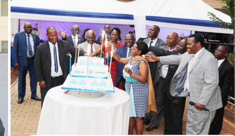
Members of Top Management cutting cake at the End of year 2018 staff party.