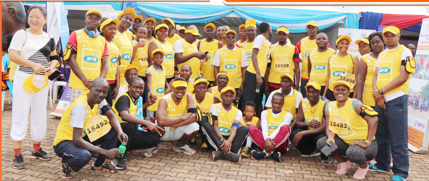
In Set are UBOS Members of Management and staff who took part in the 2019 MTN Marathon as Part of the Corporate Social Responsibility activities of the Bureau.