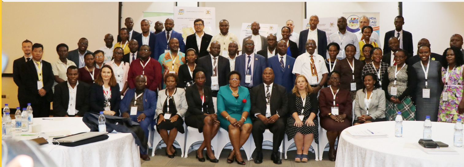
Seated in Green is Ms. Persis Namuganza –Minister of State for Lands with Members of UBOS Management and Participants at the Launch of the Natural Capital Accounting Framework held at Mestil Hotel, Kampala.

The Government of Uganda through the Uganda Bureau of Statistics adopted the natural capital accounting framework by launching the national plan and the first set of land and water accounts for the country based on the statistical Standard System of Environmental Economic Accounting. The accounts were launched Hon. Persis Namuganza, State Minister for Lands at Mestil Hotel- Kampala as part of the activities to mark the Africa Statistics Week.