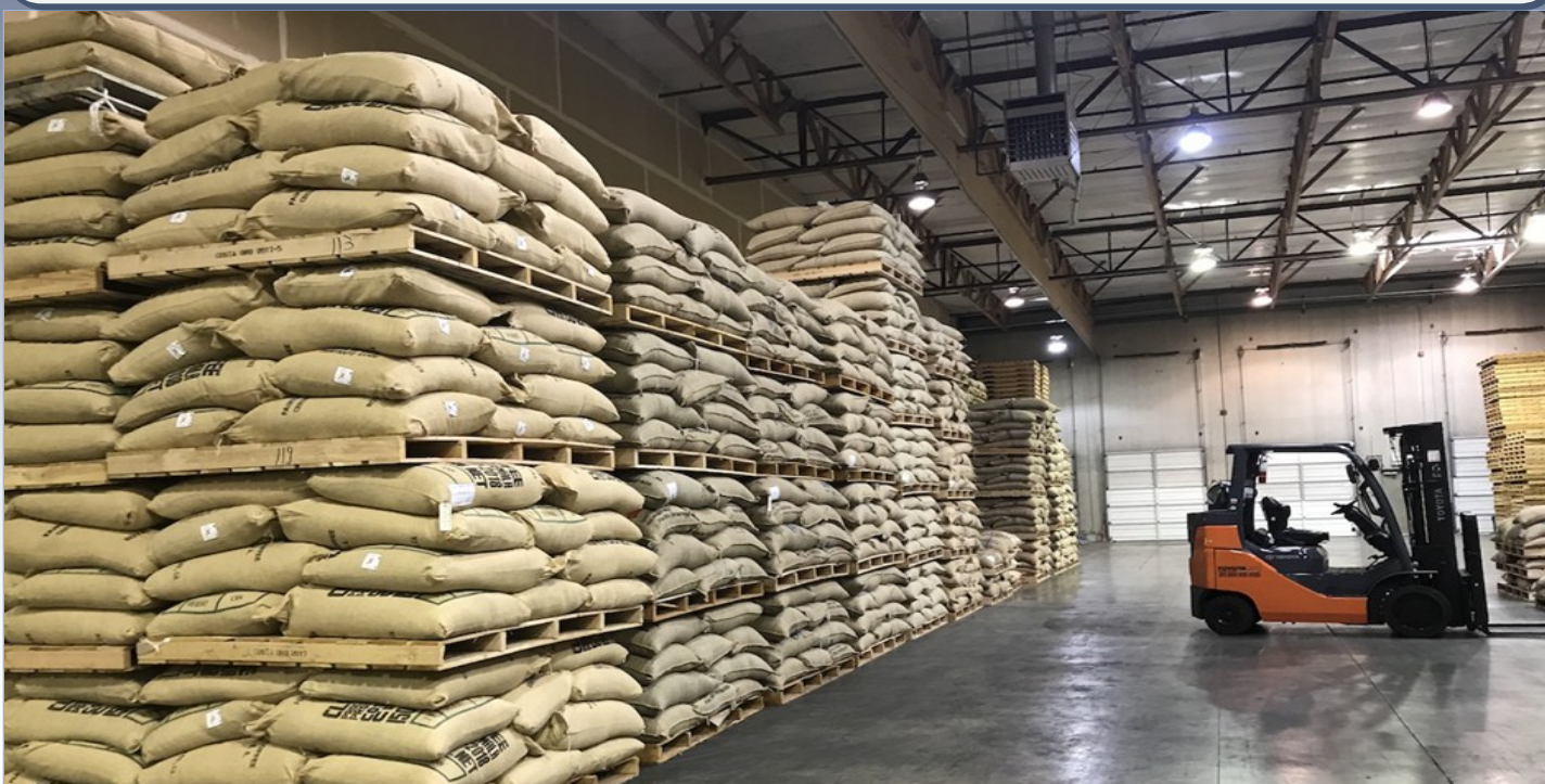
Some of the products in a factory environment

The PPI for manufacturing and utilities (M&U) is set to be disseminated on Wednesday March 31, according to the UBOS release calendar. This confirmation comes after the directorate of Business and Industry Statistics collected data, validated and computed the index for the month of February from the selected establishment from all the regions of the country.