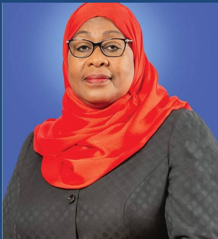
Mhe. Samia Suluhu Hassan Rais wa Jamhuri ya Muungano wa Tanzania

Suluhu was born on 27 January 1960, she hails from Makunduchi, an