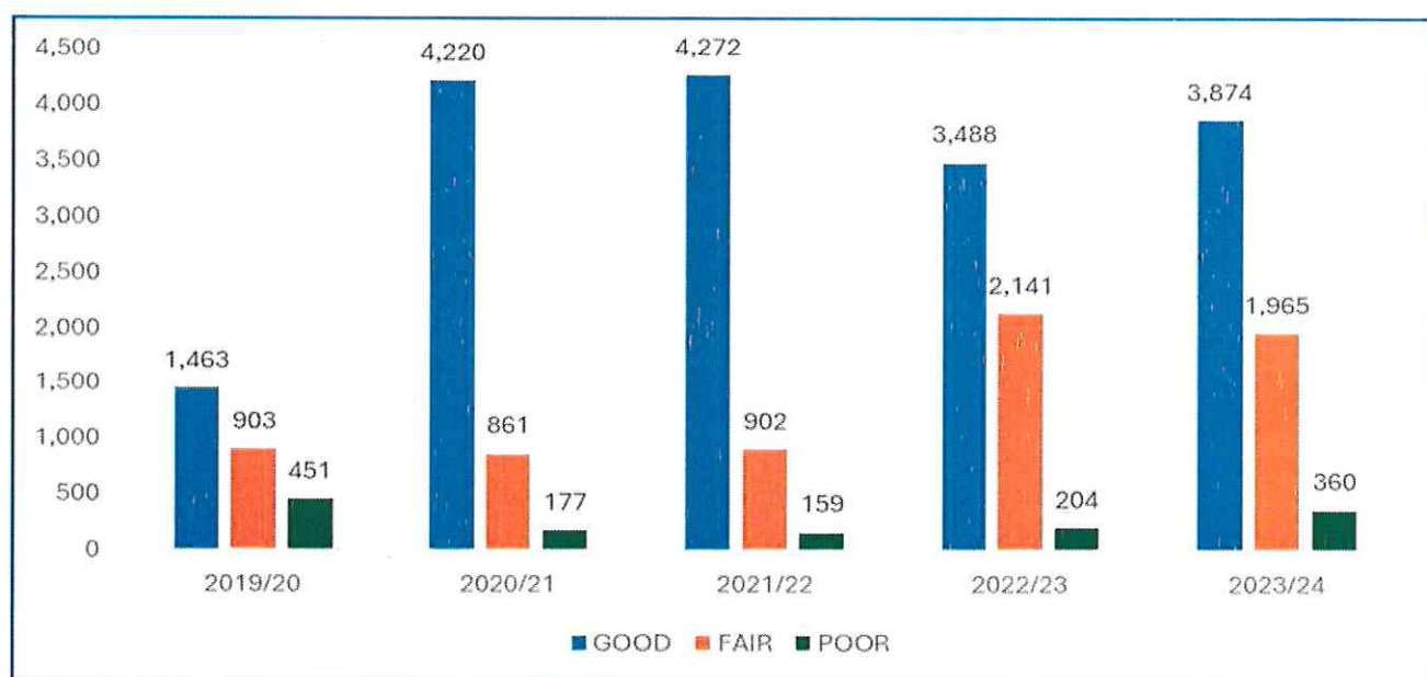
Figure 10.1: Condition of paved roads (km) as of June 2024, 2019/20 -2023/24

By June 2024, the total paved roads in the country were at 6,199km, out of these 3,874 were established to be in good condition representing 62.5 percent of the total paved roads, this was followed by fair roads with 1,965 km representing 31.7 percent. The Kms of roads under poor conditions were 360 km representing only 5.8 as shown in Figure 10.1.