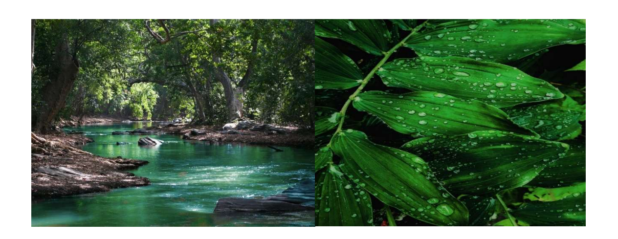
System of Environmental Economic Accounting-Water accounts of 2020 to 2021