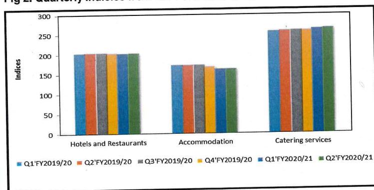
Fig 2. Quarterly Indices from Q2' FY2019/20 to Q2' FY2020/21