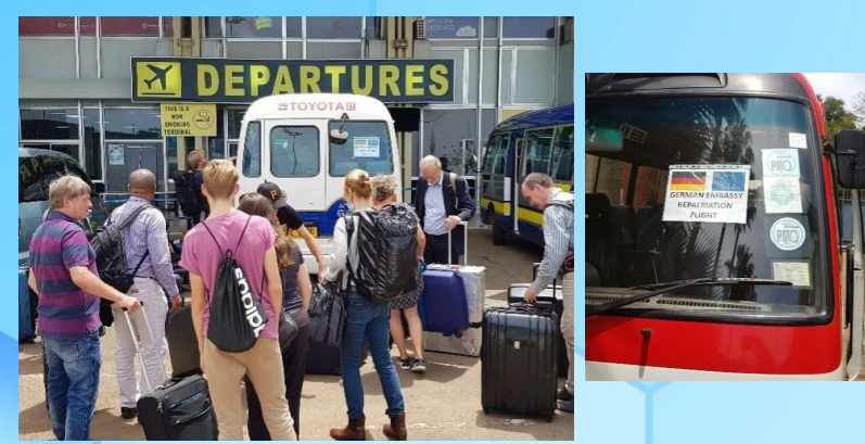
The repatriated German Nationals prepare to go through the Departures Lounge at Entebbe International Airport.

Through a special bi-lateral arrangement, the German Government thorough her foreign office has evacuated over 250 of its citizens including other stranded tourists and visitors. All the evacuated persons flew from Entebbe to Cologne aboard a chartered Brussels Airlines plane. The Germany Embassy in Uganda encouraged all its citizens to stay safe and resume their visitations to the Pearl of Africa once the COVID_19 pandemic is defeated.