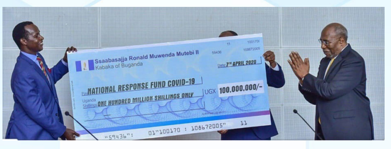
Rt. Hon Ruhakana Rugunda, Prime Minister of the Republic of Uganda receives a cheque of 100 million from Prince Wasajja being a donation from His Highness the Kabaka of Buganda to the National COVID_19 Taskforce.

PRESIDENT MUSEVENI ISSUES MORE STRINGENT DIRECTIVES IN HIS LATEST NATIONAL ADDRESS