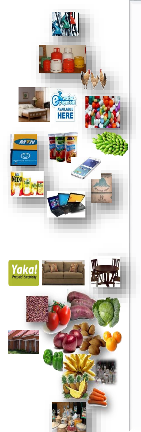
Table 1. Overall CPI and Rates of Inflation (Base: 2016/17=100)