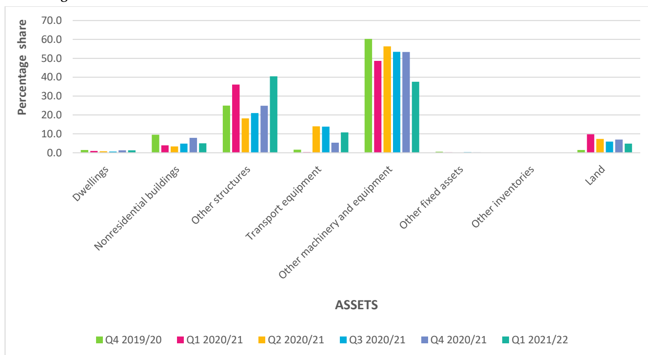
Figure 2: Trends in Acquisition of Non-Financial Assets for Central Government from Q4 2019/20 to Q1 2021/22, Percentage share

In Q1 2021/22, Expenditure on acquisition of Non-Financial Assets was Shs. 1.5 trillion, of which Shs 719.5 billion was spent on Machinery and equipment which accounted for 48.3 percent. This was followed by expenses to acquire Buildings and structures of Shs 696.8 billion, representing 46.8 percent. About Shs. 71.8 billion shillings was spent on acquisition of Land and this accounted for 4.8 percent, See Figure 2 below and Table 1c (i) and 1c(ii) .