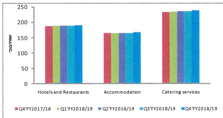
Fig 2. Quarterly Indices from Q4' FY2017/18 to Q4' FY2018/19