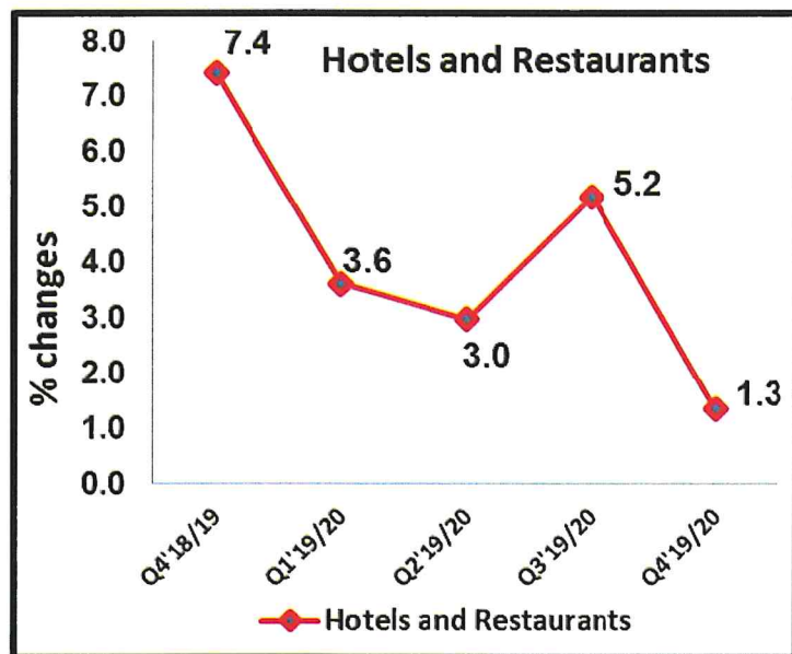
Fig 1: Annual Average Percentage Price Changes

The annual Producer prices for Hotels and Restaurants services increased by 1.3 percent with a declining trend for the year ending Quarter four FY2019/20 compared to the 7.4 percent increase recorded in the year ended Quarter four FY2018/19.