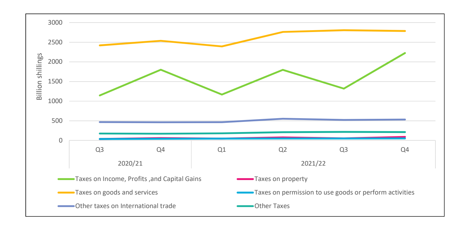
Figure 1: Trends in Tax revenue from Q3 2020/21 to Q4 2021/22, Billion shillings

From the graph above, for the period under review, it can be observed that there was a decrease in two tax categories from Q3 2021/22 to Q4 2021/22. The two categories were taxes on goods and services which