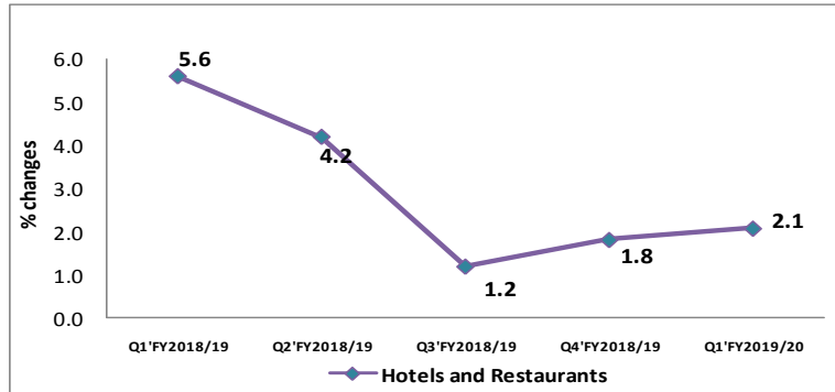
Fig 1: Annual Average Percentage Price Changes

The annual Producer prices for Hotels and Restaurants services increased by 2.1 percent for the year ending Quarter 1 FY2019/20 compared to the 5.6 percent increase recorded in the year ended Quarter 1 FY2018/19.