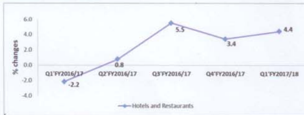
Fig 1: Annual average % price changes quarter 1, FY2016/17 to quarter 1 FY2017/18

The Annual Producer Prices for the Hotels & Restaurants Industry increased by 4.4% in the first quarter of FY2017/18 compared to a fall of 2.2% in the same period of FY2016/17.