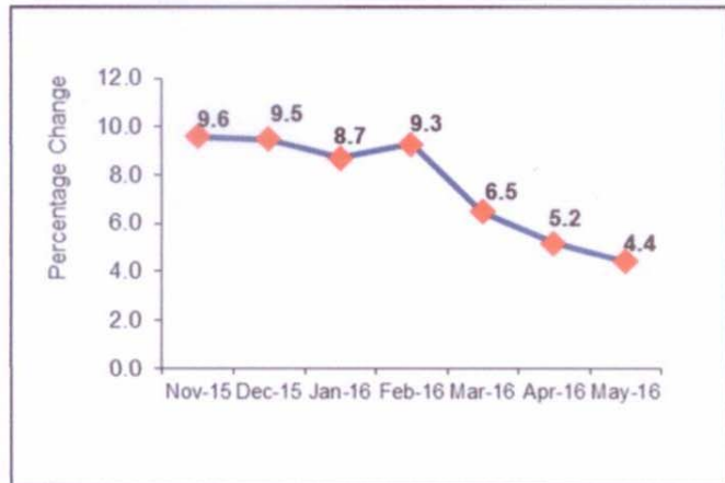
Figure 1: Trend in PPI-M Nov 2015 - May 2016

The Producer prices for manufactured goods increased by 4.4% for the year ending May 2016 compared to the year ended May 2015.