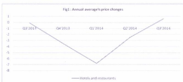
Figure 1 shows fluctuation of prices from Quarter 3, 2013 to Quarter 3, 2014.

The graph below shows the price index level changes for the period under review: