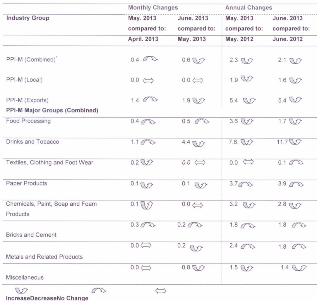
Table1. Percentage changes in PPI-M