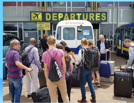
The repatriated German Nationals prepare to go through the Departures Lounge at Entebbe International Airport.

Across the EAC, the number of confirmed cases now stands at 372 persons as of April 08, 2020 with Kenya accounting for 179 (48%) followed by Rwanda at 110 (30%).