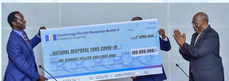
Rt. Hon Ruhakana Rugunda, Prime Minister of the Republic of Uganda receives a cheque of 100 million from Prince Wasajja being a donation from His Highness the Kabaka of Buganda to the National COVID_19 Taskforce.